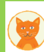
ELLI: Curious Cat Learner